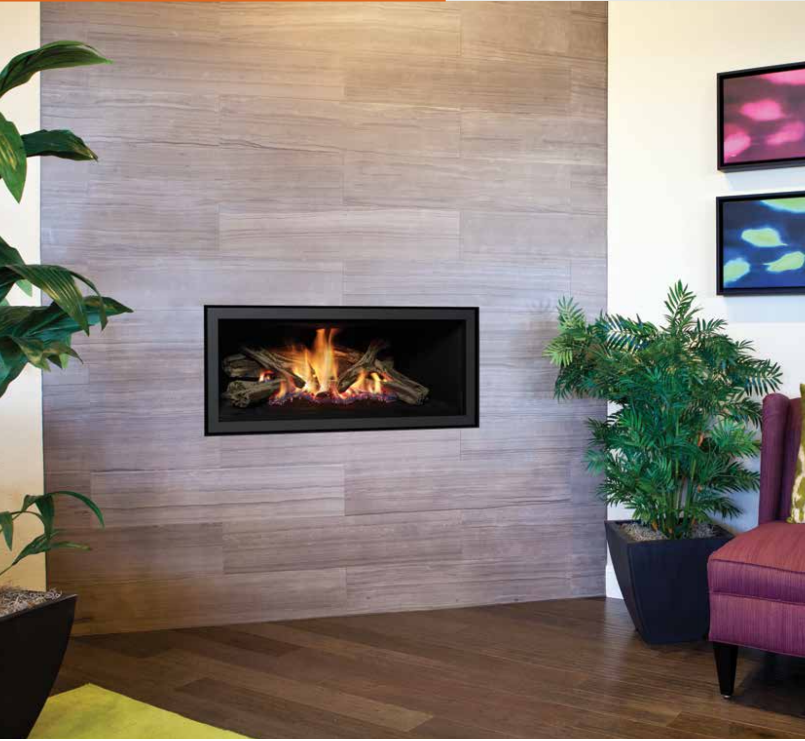
Regency Greenfire GF900L gas fire shown with a clean edge finish (shown without mandatory dress guard).